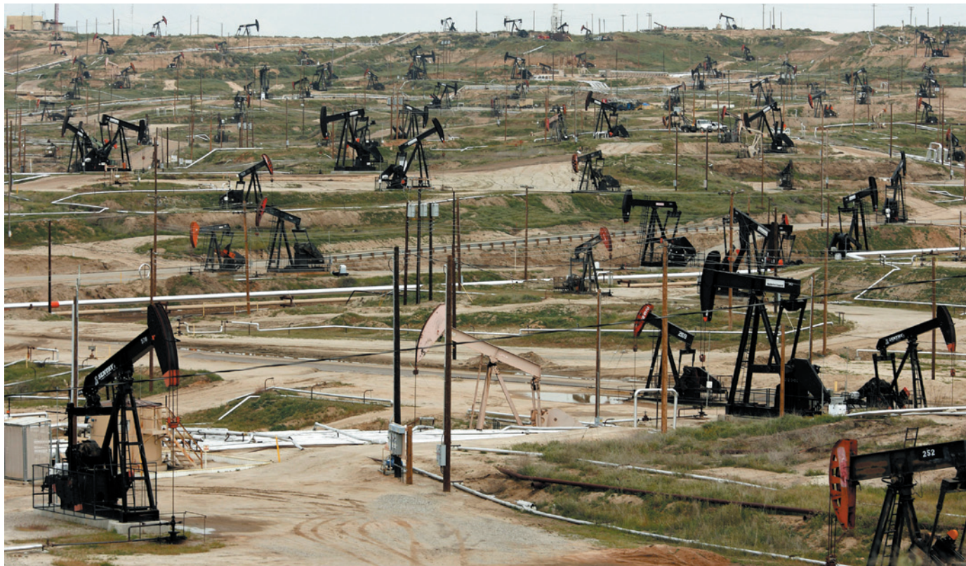
Production at oil fields globally, including at the Kern River oil field in Bakersfield, California, is declining at about 4–6% a year.